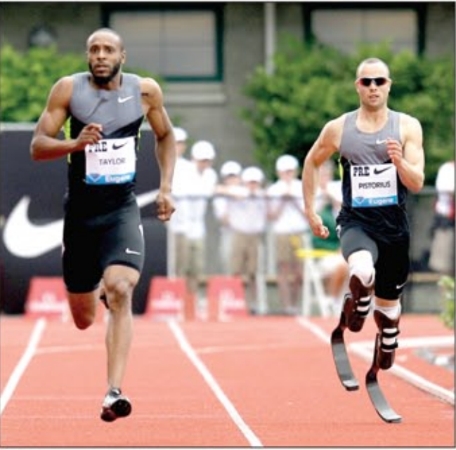
Oscar Pistorius, right, of South Africa, races against United States' Angelo Taylor, left, in the 400-meter event on Saturday at the Prefontaine Classic athletics meet in Eugene.