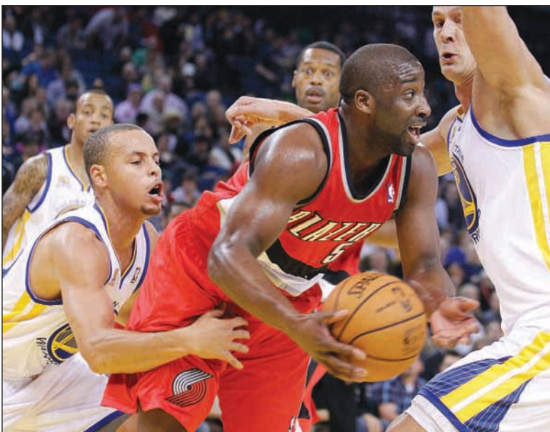
Portland Trail Blazers' Raymond Felton (5) looks for a way around Golden State Warriors' Andris Biedrins, right, and Stephen Curry, left, during the first half of an NBA basketball game Wednesday in Oakland, Calif.